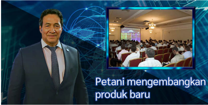
Petani mengembangkan produk baru